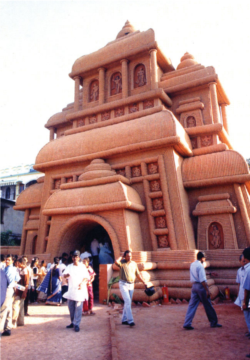
Figure 5. (Colour online) Theme puja: Earthen teacup pandal, Bosepukur, 2001.