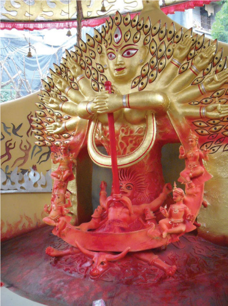
Figure 9. (Colour online) Art puja: Bhabatosh Sutar Durga in the form of a giant flame. Naktala Udayan Sangha puja, 2009.

barges. . . . The epitomic image of the occasion remains that of the goddess' upturned face and clenched fists gently bobbing above water, surrounded by fragments of her ornaments and weapons. But in stark contrast stands today's surreal scene of the mauling of the images by cranes, as flaying limbs and torsos drop from above, and detached heads pop out of the mangled bodies of straw and clay. 46