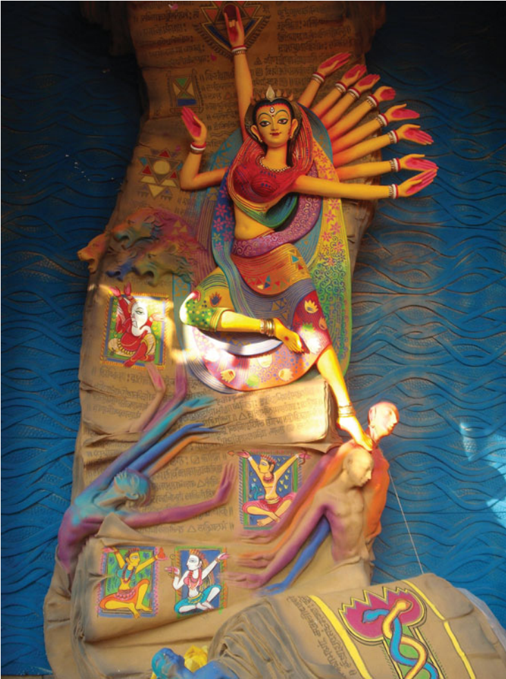
Figure 8. (Colour online) Art puja: Sanatan Dinda fibreglass Durga, 95 Pally puja, Jodhpur Park, 2012.

Offloaded from the trucks, stripped of the flowers and other Puja accessories on their bodies that are to be deposited in vast garbage vats, these vast images on their wooden frames are circled around a few times by the coolies to hoarse cries of victory to the goddess and invocation of her return the next year, before they are lowered onto the muddy banks, and pushed to the edge of the waters. The images are given a token submersion in the river, but they are no longer allowed to float away into the deep. Contained within a roped enclosure, the job of the cranes is to immediately scoop up the bodies and give them a ritual dip in the waters before dumping these idol corpses on the