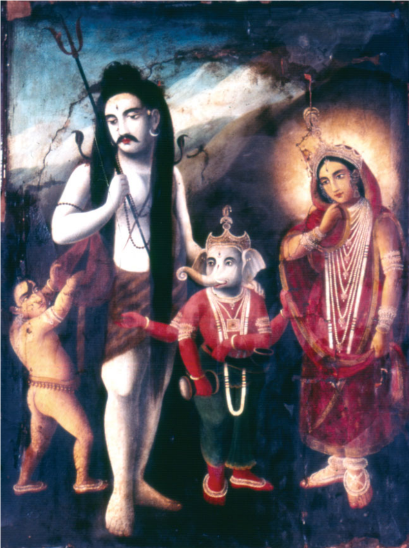
Figure 1. (Colour online) Shiber Paribar, The Family of Shiva. Anonymous oil painting circa the nineteenth century.

promiscuous entanglements with the everyday worlds of human consumption and celebrations. 43