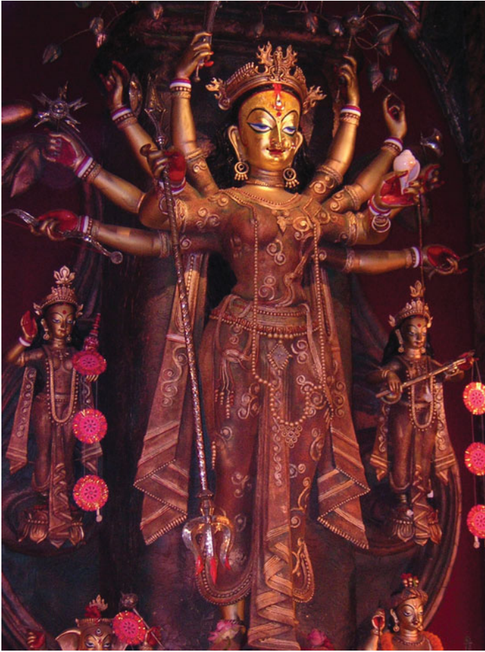
Figure 7. (Colour online) Art puja: Sanatan Dinda Durga in the form of a Tibetan bronze sculpture, Nalin Sarkar Street, 2006. Source: Guha-Thakurta, In the Name of the Goddess , p. 257. Used with kind permission of the author.

brings about its own expulsion and withdraws from the scene, thereby releasing the community from its direct contact. 45