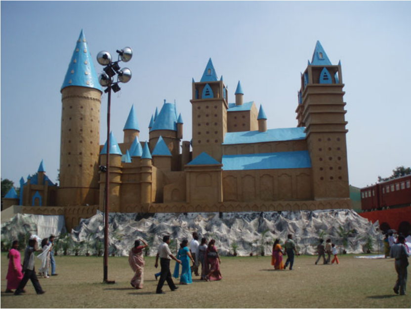
Figure 6. (Colour online) Theme puja: Harry Potter castle, FD Block puja, Salt Lake, 2007.

to the beat of the dhak (the local drum), 44 some clearly inebriated. The expenditure of surplus comes to its culmination. Here profane is, I hold, pure festivity, an eternally transient world. Benjamin will explain this state as liberation from the sacred, but without simply abolishing it: to remove an object from the sacred context and return it to the sphere of the profane, without negating or nullifying its sacred history.