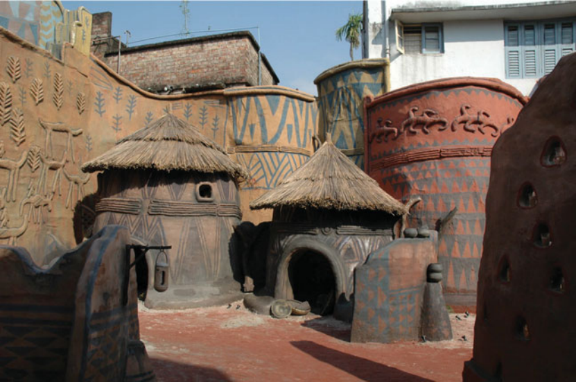
Figure 3. (Colour online) Theme puja: Ghana village. Barisha Sahajatri puja, 2004.