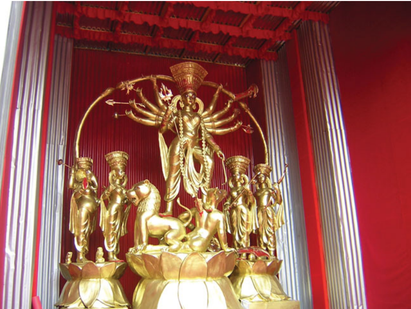
Figure 4. (Colour online) Theme puja: Gilted Durga with Egyptian-style costume and headdress, Hatibagan, 2007.