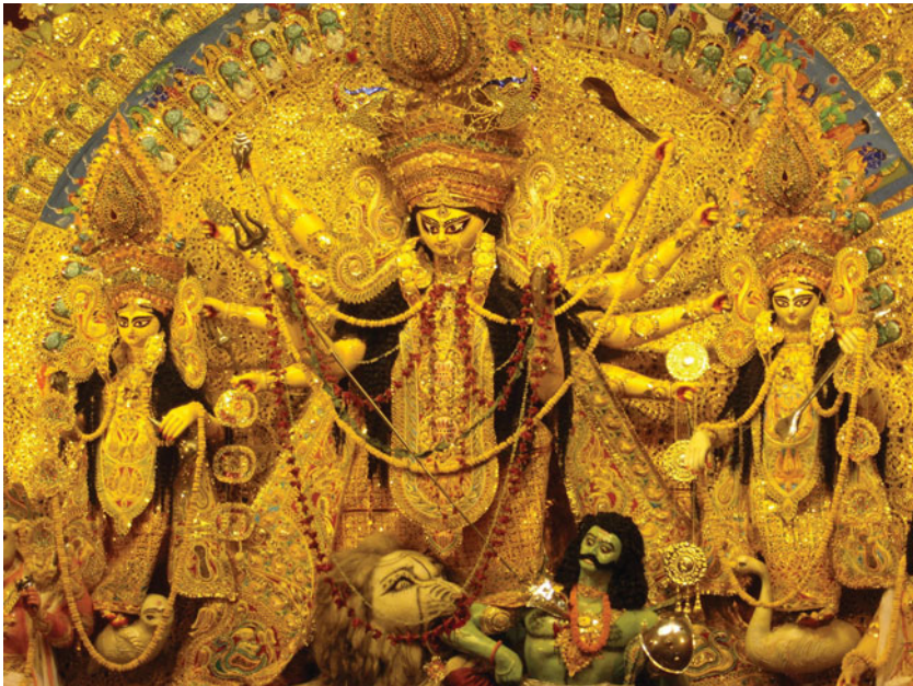
Figure 12. (Colour online) Daker Saajer puja: Maddox Square Durga image, 2008. Source: Guha-Thakurta, In the Name of the Goddess , p. 68. Used with kind permission of the author.

nor a puja mandop (site), but more like a warehouse of yesteryear's divinity. Locally, the place soon acquired the nom de plume 'thakur-der gallery' (the gallery of the gods and goddesses), referring to Durga and her sons and daughters. A year later, with no maintenance and no visitors, the museum lay in shambles, its open-air displays broken and the grounds covered in slush and stagnant water. The strength of the art or theme puja lies in its non-fixity, its fungibility, located in a public discourse and performance of sacred and secular, of commerce and aura, art and stunt. The steel figure of the blood-sucking monster, Raktabeej, brought from the nearby Lake Temple Road Shibmandir puja tableaux, stands mauled by storms. The giant feet that Sanatan Dinda constructed for the Barisha Club pavilion is now part of the lakeside garbage. 47 Ironically, this is quite in fitting with the spirit of Durga puja, for, at its best and worst, it is