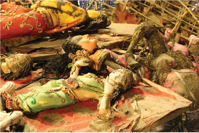
Figure 14. (Colour online) Abandoned and desecrated. Source: Guha-Thakurta, In the Name of the Goddess , p. 339. Used with kind permission of the author.