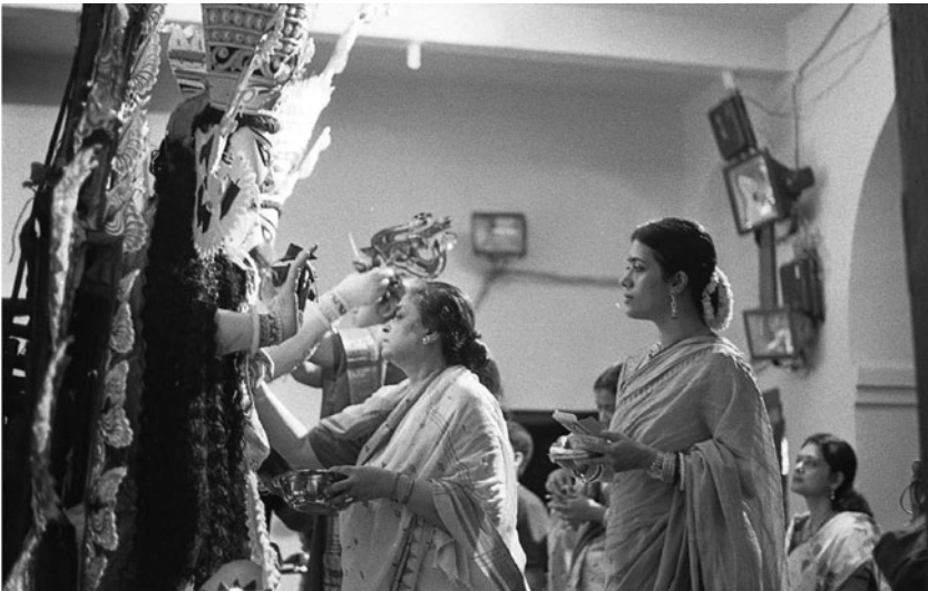
Figure 15. Women performing sindurkhela before bidding farewell to the goddess.