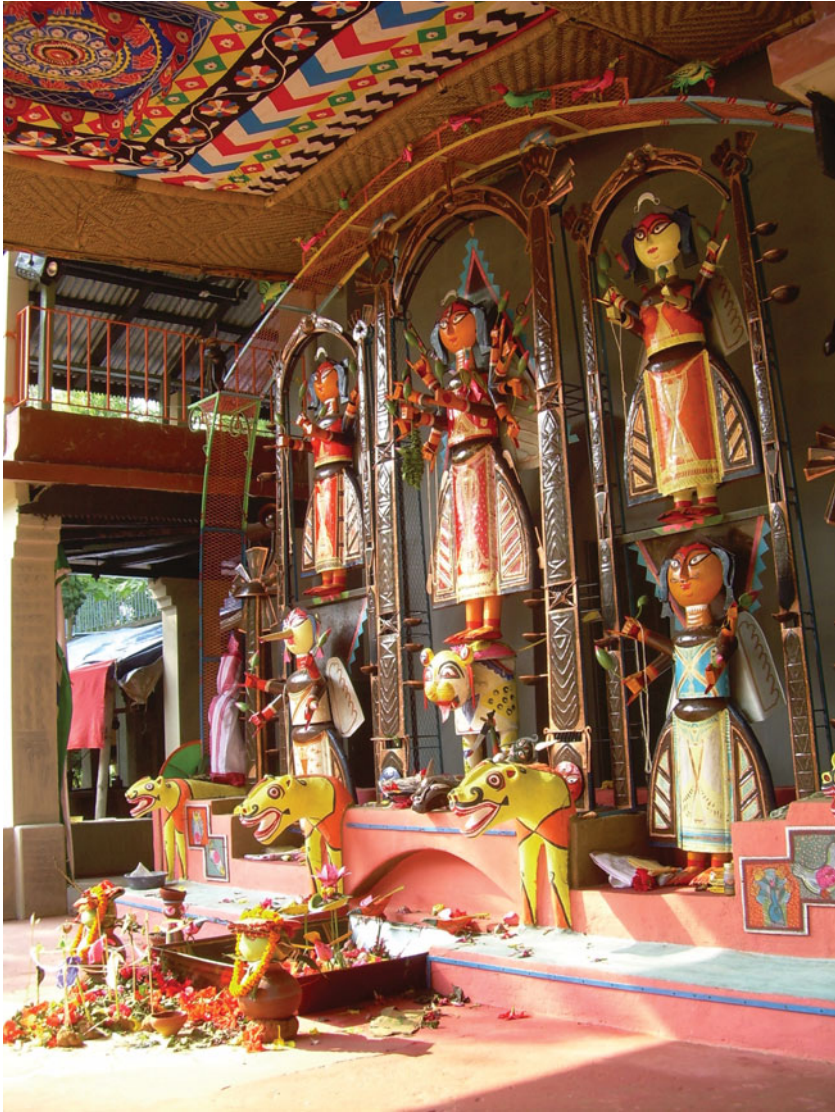
Figure 13. (Colour online) Goddess group made out of painted cast iron and metal utensils, Sonajhuri, 2005.

a performance of transversal, a constant transmuting of identities. Clearly, ephemerality, destruction, and disintegration is constitutive of the entity of the 'art' puja, underscoring its liminal 'art but not quite' status.