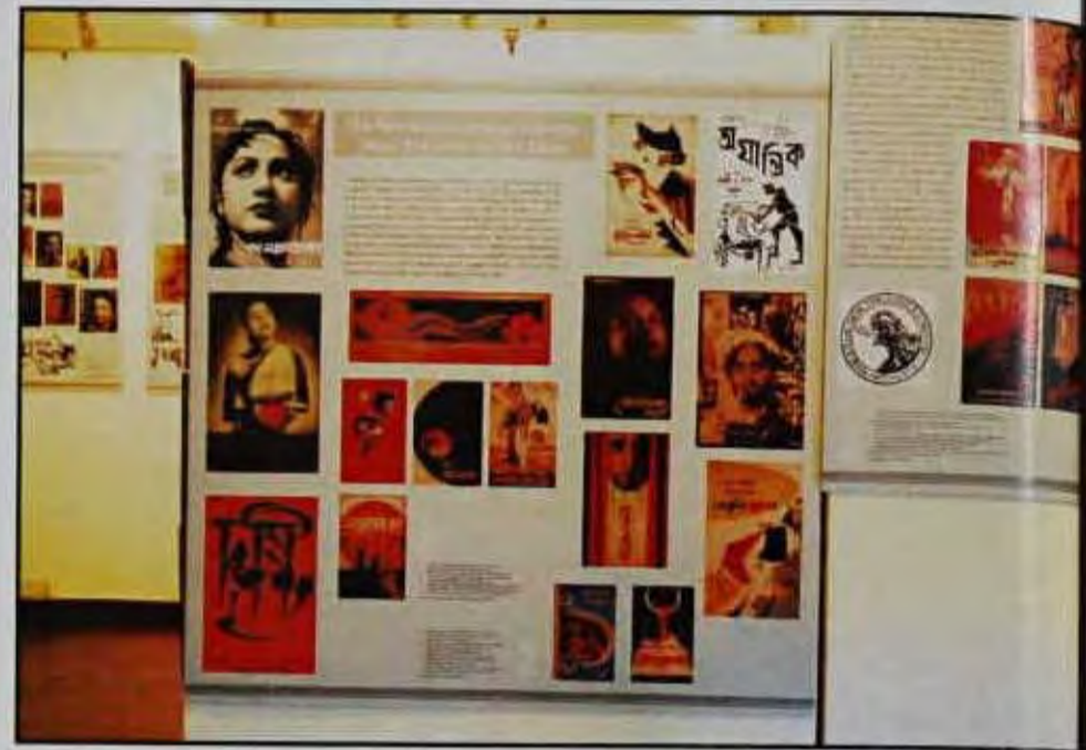
◀ The Display ▶