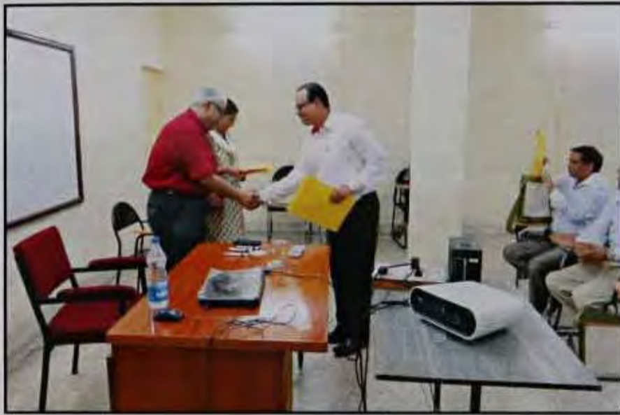
Distribution of Participation Certificates by the Director & Co-Director, CTRPFP to the participants of the training workshop