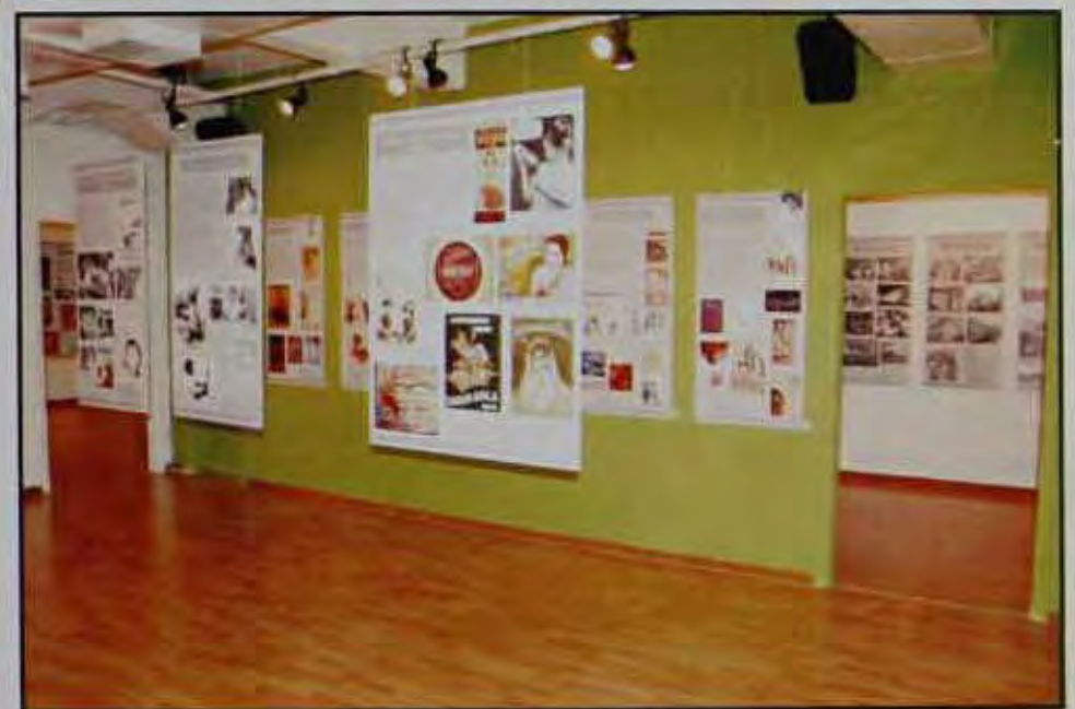
▲ The Display ►