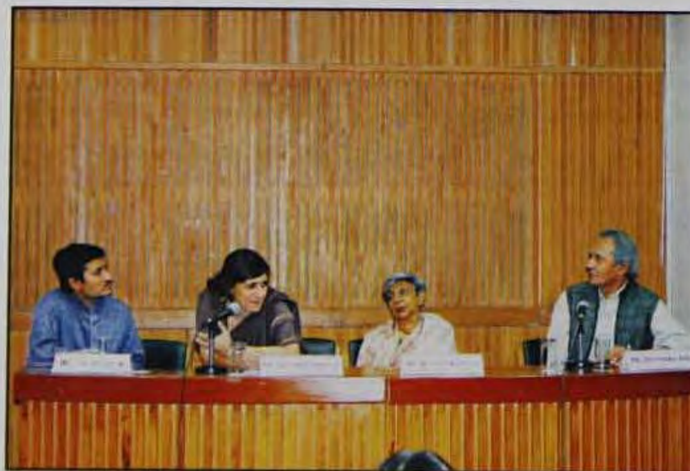
◀ Panel discussion on "Visual Archives & Cultural Histories", March 28, 2012