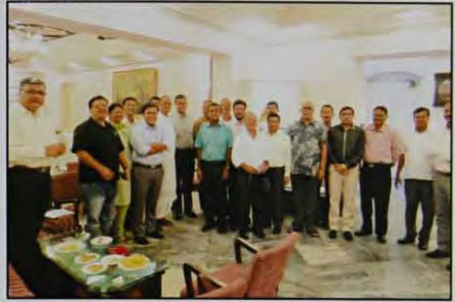
Participants of Training Workshop attending a conference dinner along with Shri Amit Mitra, Minister In Charge, Finance, Govt. of West Bengal