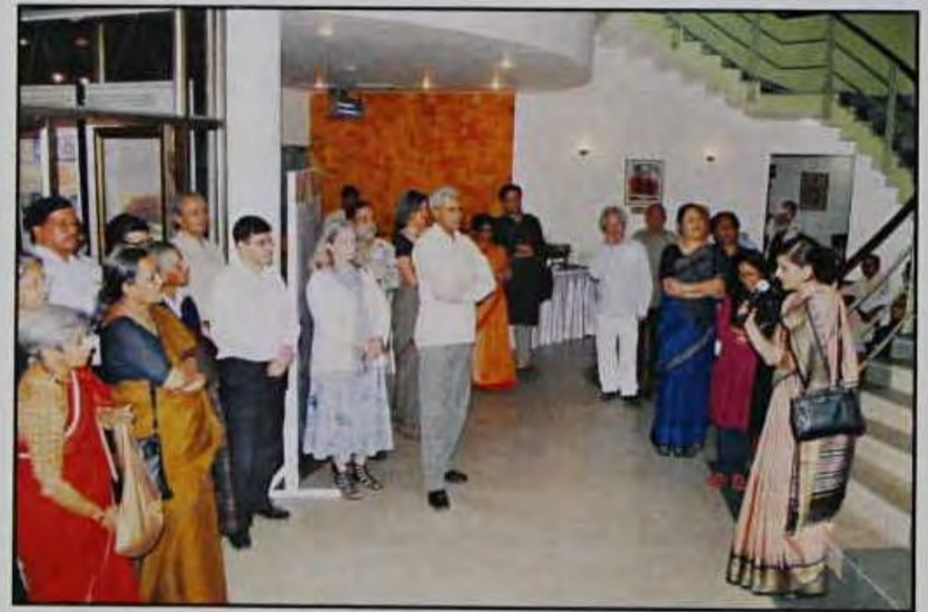
◀ The Curator's speech at the opening ▶