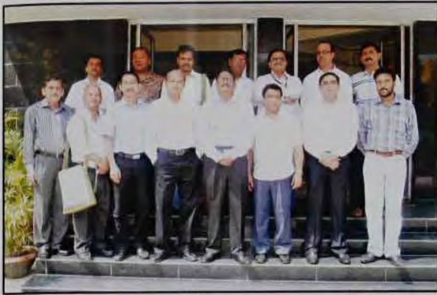
Group Photo of the Participants for the Five Day Training Workshop on Fiscal Issues and State Finances (8th to 12th October 2012)